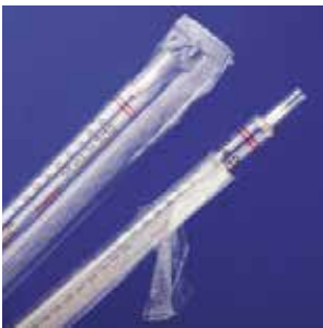
Clear plastic wrap