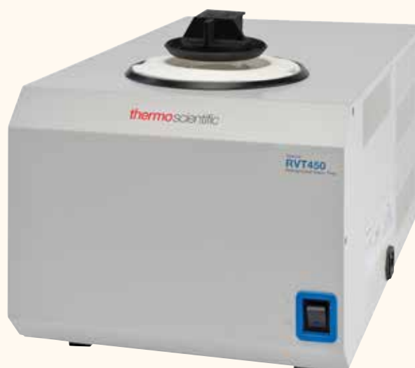
Savant RVT450 Refrigerated Vapor Trap

If you are evaporating organic solvents, check the efficiency of the cold trap. Start the run with a clean, empty GCF in the cold trap. After the run is over and the samples are dry, remove the GCF and allow the contents to thaw. Pour the solvent into a graduated cylinder and measure what has been collected. Divide that number by the total started with and multiply by 100 for the percentage of solvent trapped. It should be 85 to 95% for best operation.