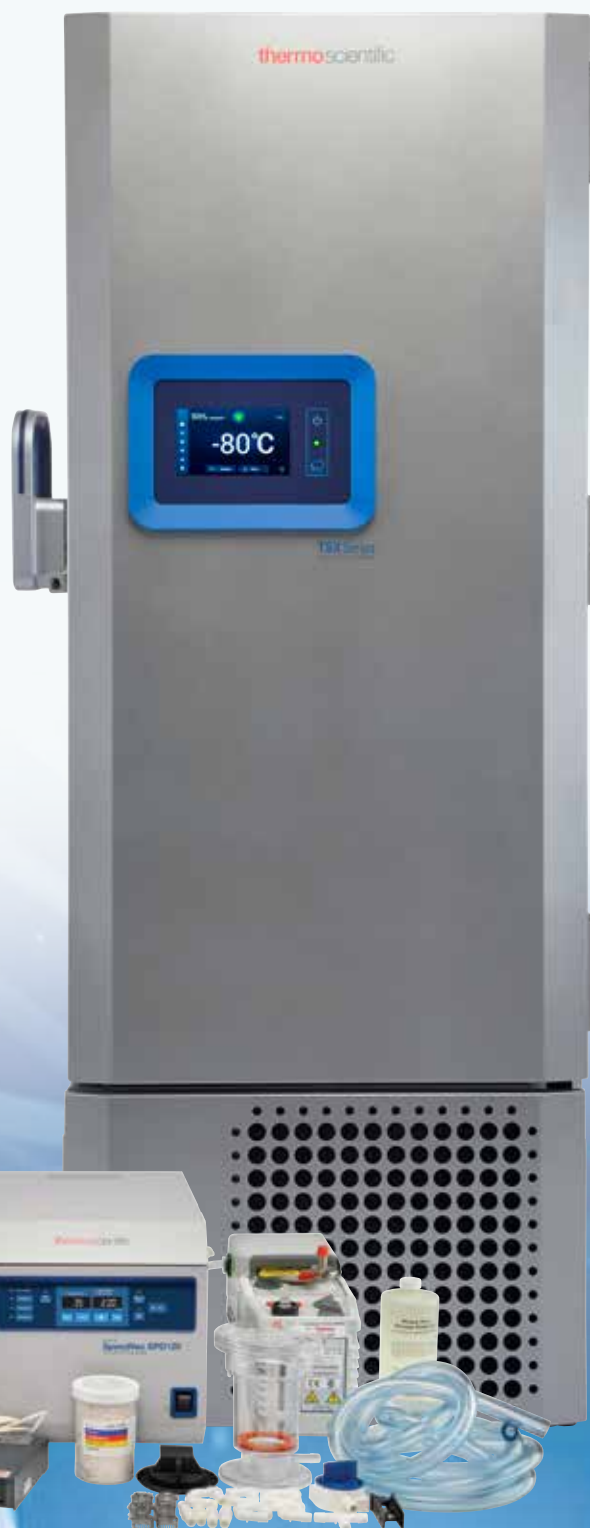
Savant SpeedVac SPD120 Vacuum Concentrator Kit, Thermo Scientific TSX400 Ultra-Low Temperature Freezer

What is risk if the solvents goes into a liquid state instead of sublimation? If the sample warms to the point where the solvent turns into liquid, there is a risk of sample degradation. For example, if the samples are mixed with solvents such as acetonitrile or ethanol, the sample can go back into solution. Once the organics are evaporated, the water in the sample will refreeze and the freeze drying process will continue, which could change the quality of the product.