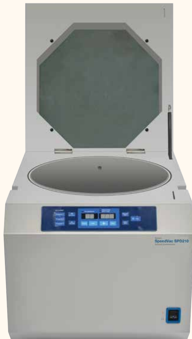
Savant SpeedVac SPD210 Vacuum Concentrator