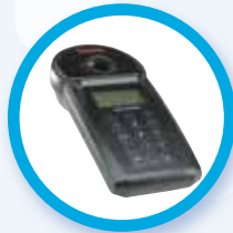
Thermo Scientific Orion Multi-Parameter Photometer