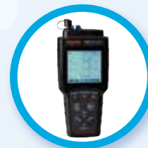
Thermo Scientific Orion Electrochemistry Meter