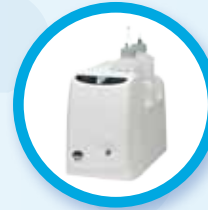
Thermo Scientific Dionex ICS 900