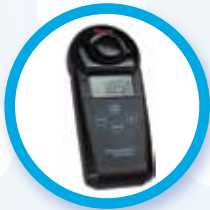
Thermo Scientific Orion Chlorine Tester

Fisher Scientific provides equipment that is essential to monitor and control water treatment processes in potable water treatment plants. For more information on how we can monitor and protect your water supply, please contact us at www.fishersci.com .