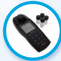
Thermo Scientific Portable Turbidity Meter