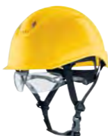
uvex pheos IES