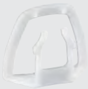
Wide-vision goggles mount uvex pheos 9790.022