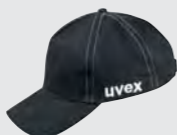
uvex u-cap sport Long brim